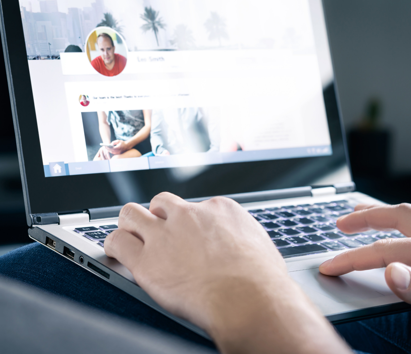
Technology user stays connected through social media page.